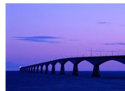
Bridging Differences - Building Alliances

More Info: http://www.clackamas.us/ccrs/training.jsp